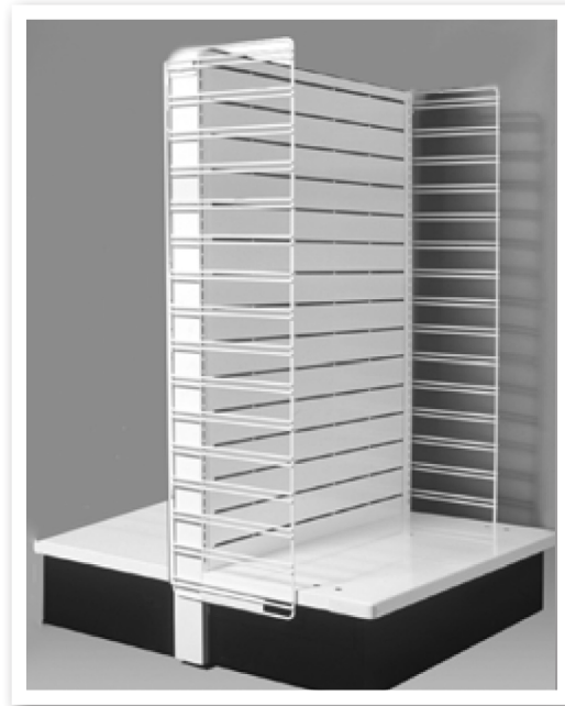
Slatwall shown is optional

1. Complete Steps 1-2 of the Basic "T" Unit Assembly Instructions.