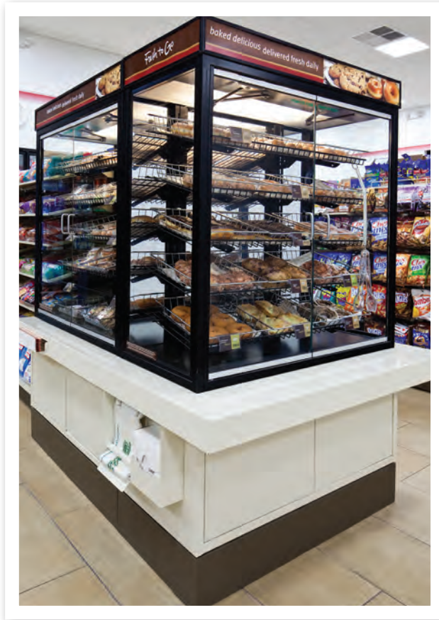
ESS Pastry Case